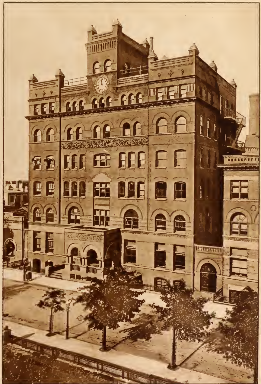
PRATT INSTITUTE, situated on Ryerson Street in Brooklyn. Founded primarily for instruction in technical courses and covering every branch of study in its field.